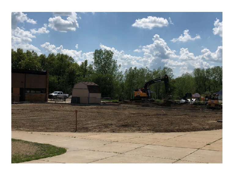
OES Playground Prep