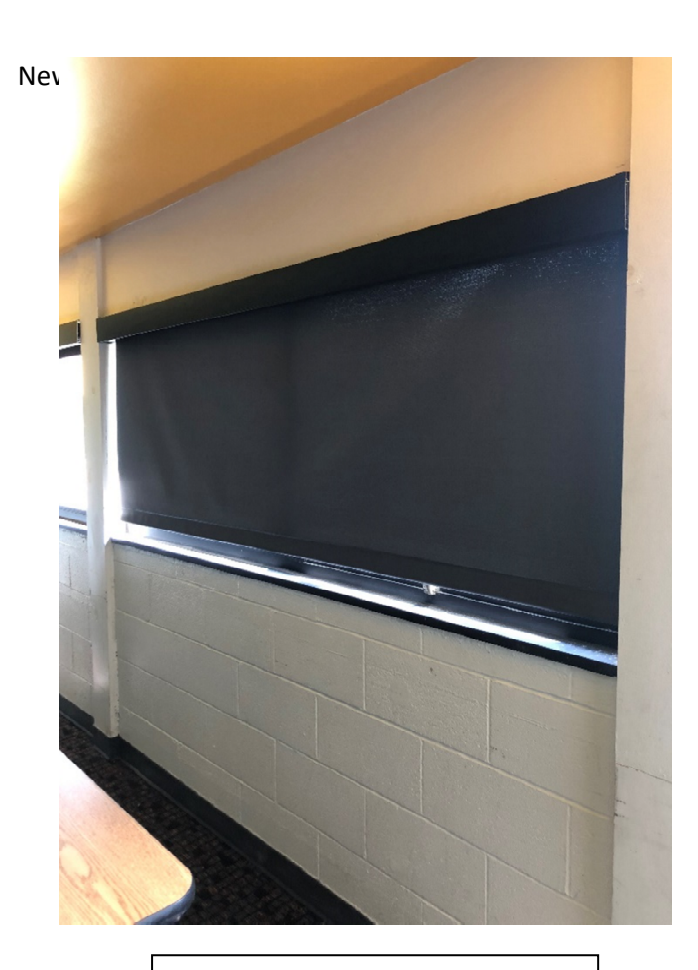
New Blinds at OES