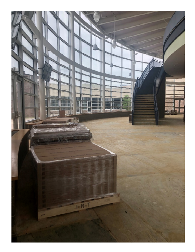
Performing Arts Center Flooring