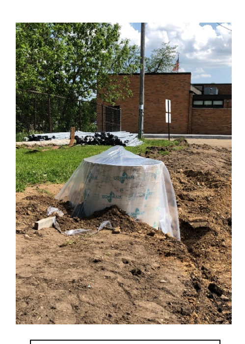
Site Lighting Pole Bases