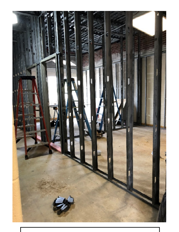
Walls at Transportation