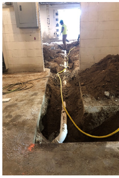
Transportation Building Demo