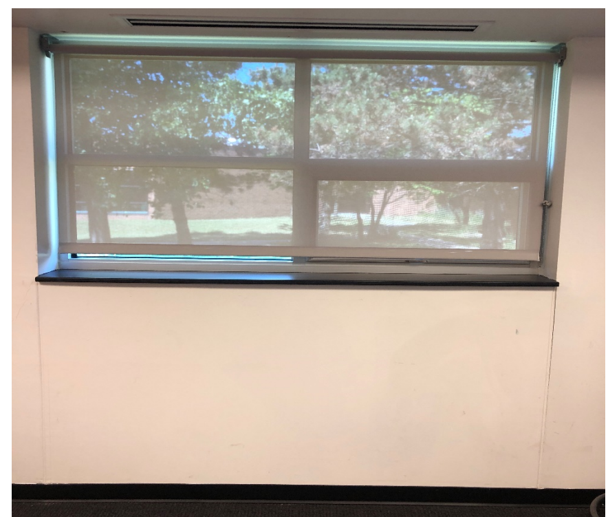
Oxford High School