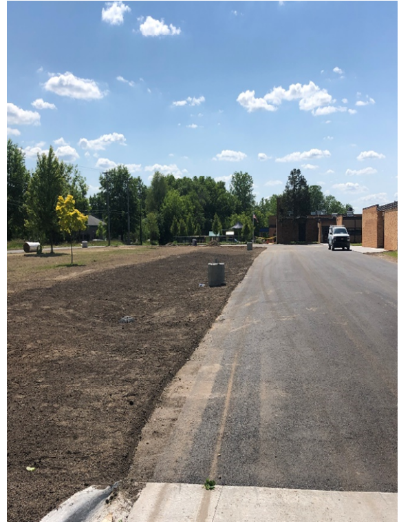
Oxford Elementary School