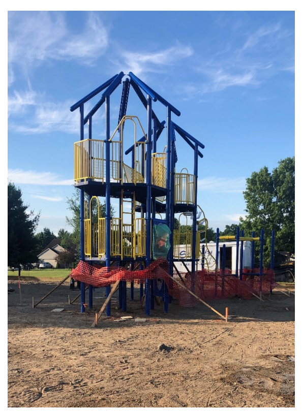
Clear Lake Elementary