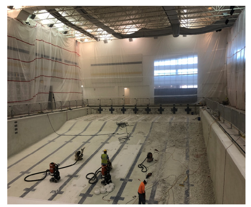
Oxford High School