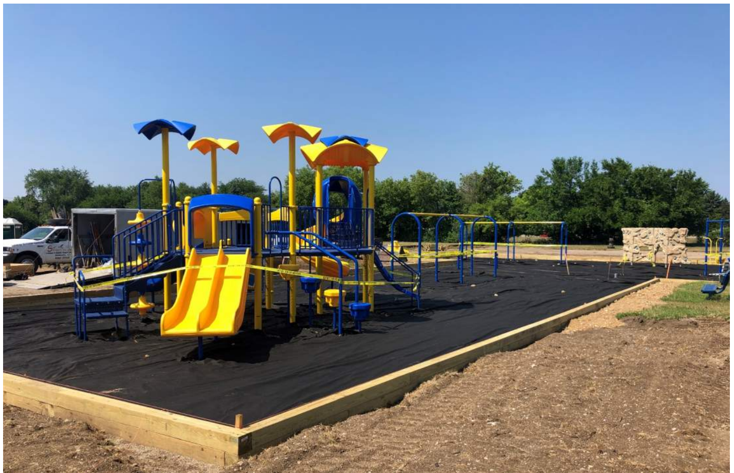
Daniel Axford Elementary