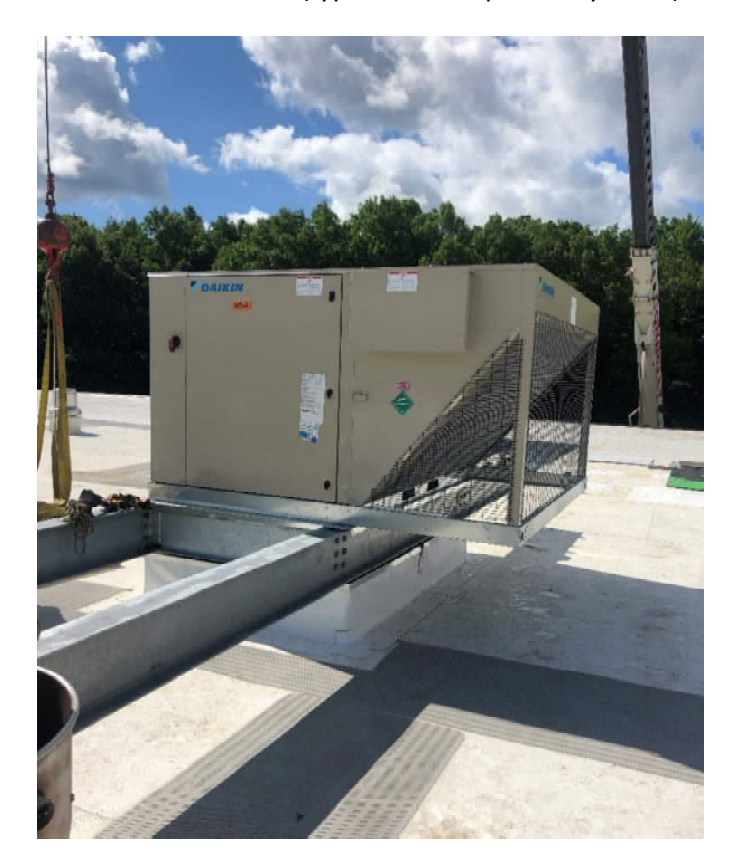
New Roof Top HVAC at Middle School Weekly Update – 07/17/2020