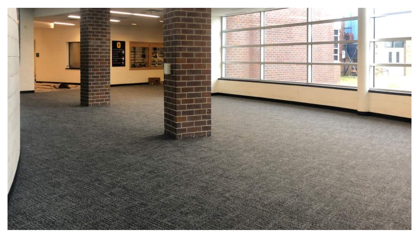
Oxford High School Walk Off Mat at Entrance