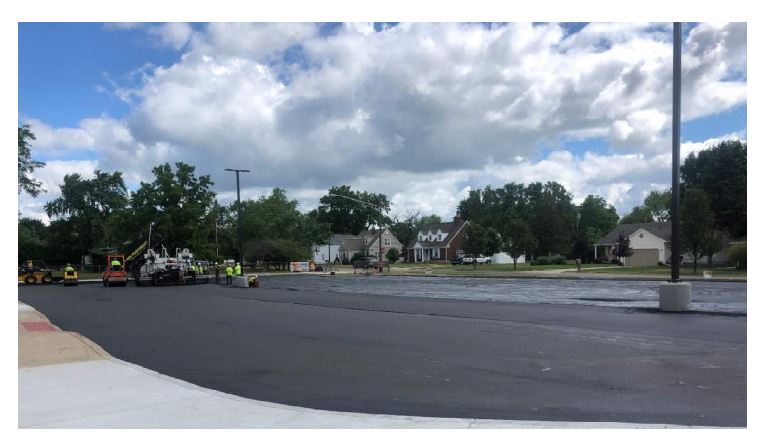
Oxford Elementary Top Course of asphalt