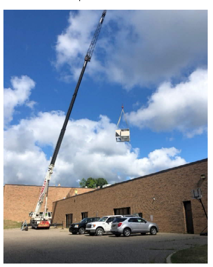
Lifting the new HVAC Equipment