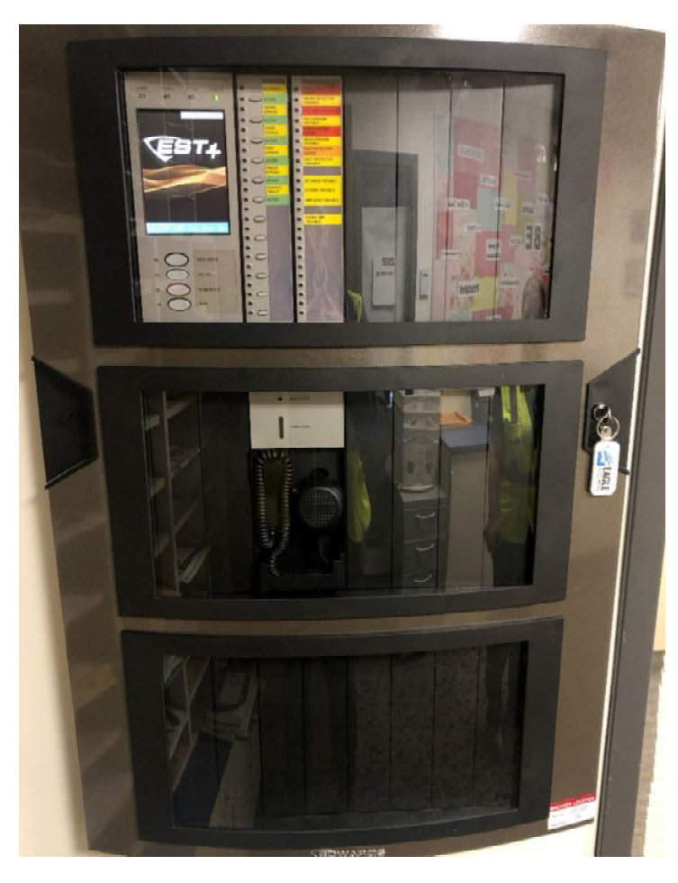
New Fire Alarm Panel (typical for all updated systems)