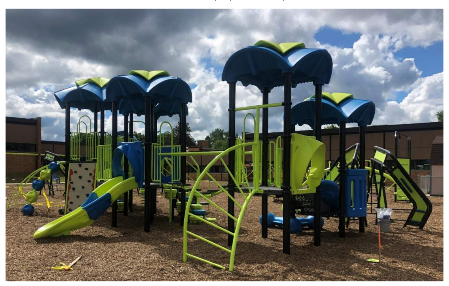
Playground at OES