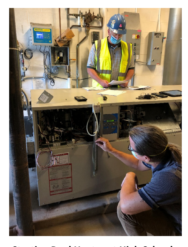
Starting Pool Heater at High School