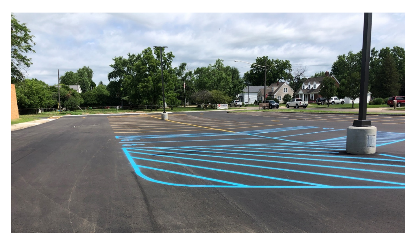
Oxford Elementary Parking Lot (before signs)