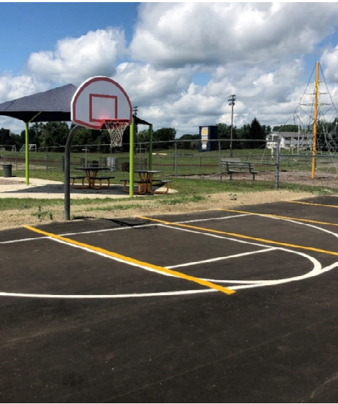
Oxford Elementary Parking Lot and Basketball Court