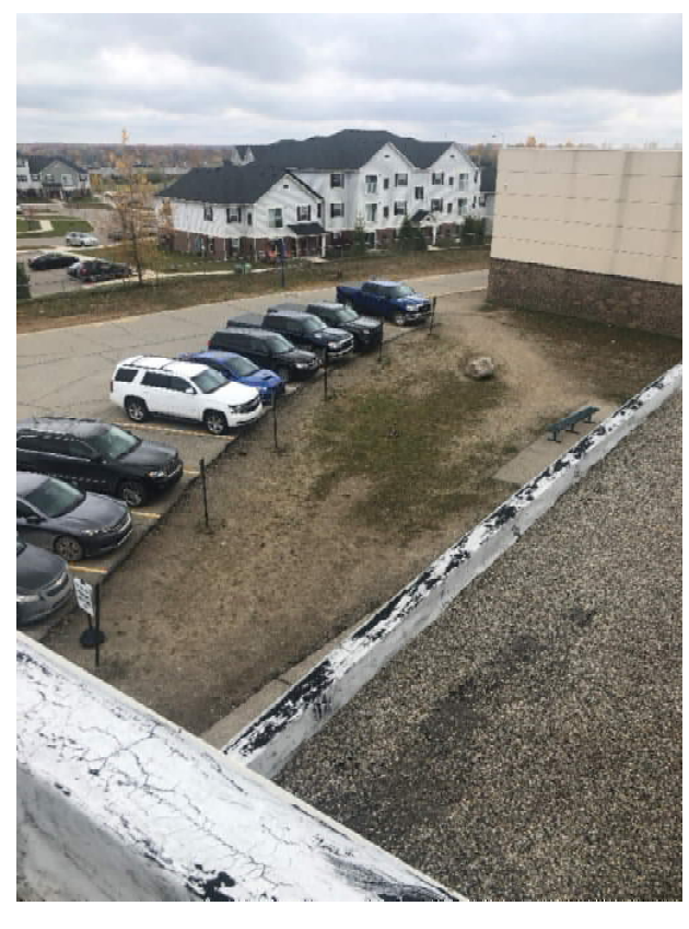
North end of West Parking Lot before renovations