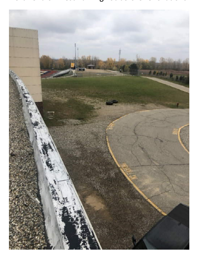
South end of West Parking Lot before renovations