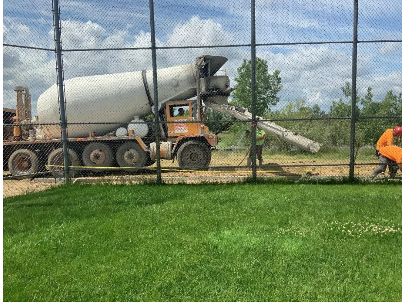
Sidewalk pour around ballfield perimeter