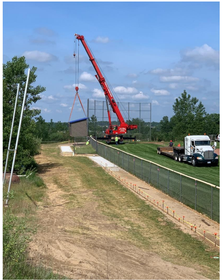
Crane Lifting 49,000 lbs. pre-cast dugout into place