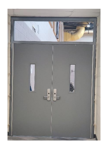
High School Auxiliary Gym