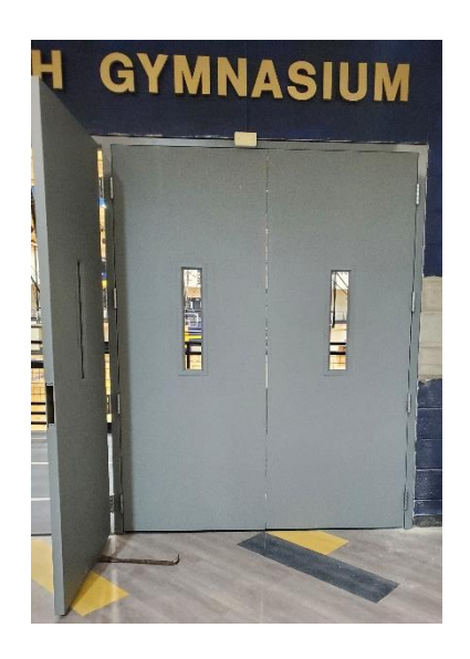
High School Main Gym